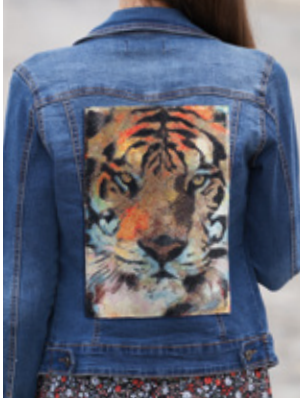
To Fabulous Fashion